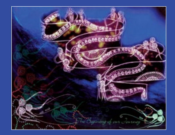
The Beginning of our Journey

The circles speak of the many people who have traveled in and out of our lives, they too taking the same path into our Journey of the Dreaming. All the while our Ancestors and family (represented by the auras) guide us there.