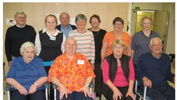
Breathe Easy Colac (BEC) support group. Members 2010